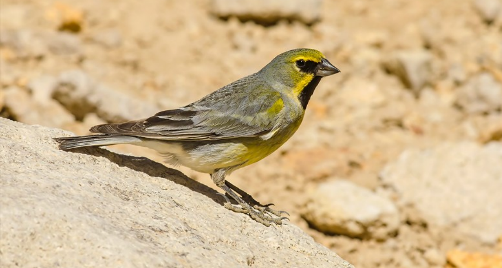
Yellow-bridled Finch - © Andrés Terán

White-browed Ground-Tyrant, Cinereous Ground-Tyrant, Ochre-naped Ground-Tyrant, Plumbeous Sierra-Finch and the rare Yellow-bridled Finch . After this we will continue our way to Villa la Angostura, where we will spend the night.