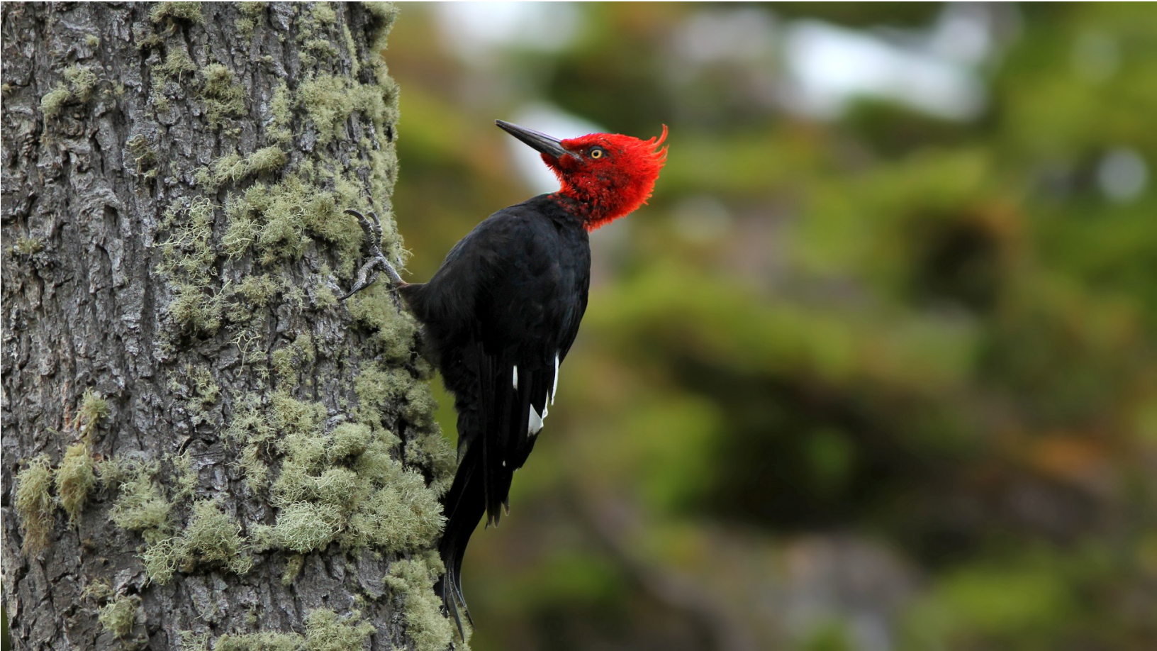
Magellanic Woodpecker – © Alec Earnshaw