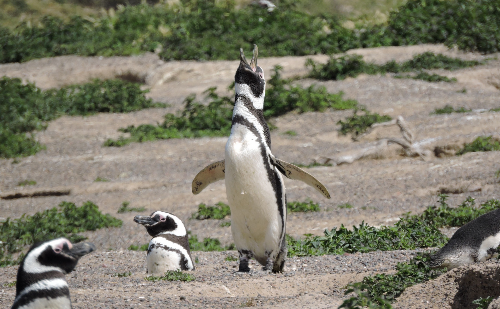
Magellanic Penguin