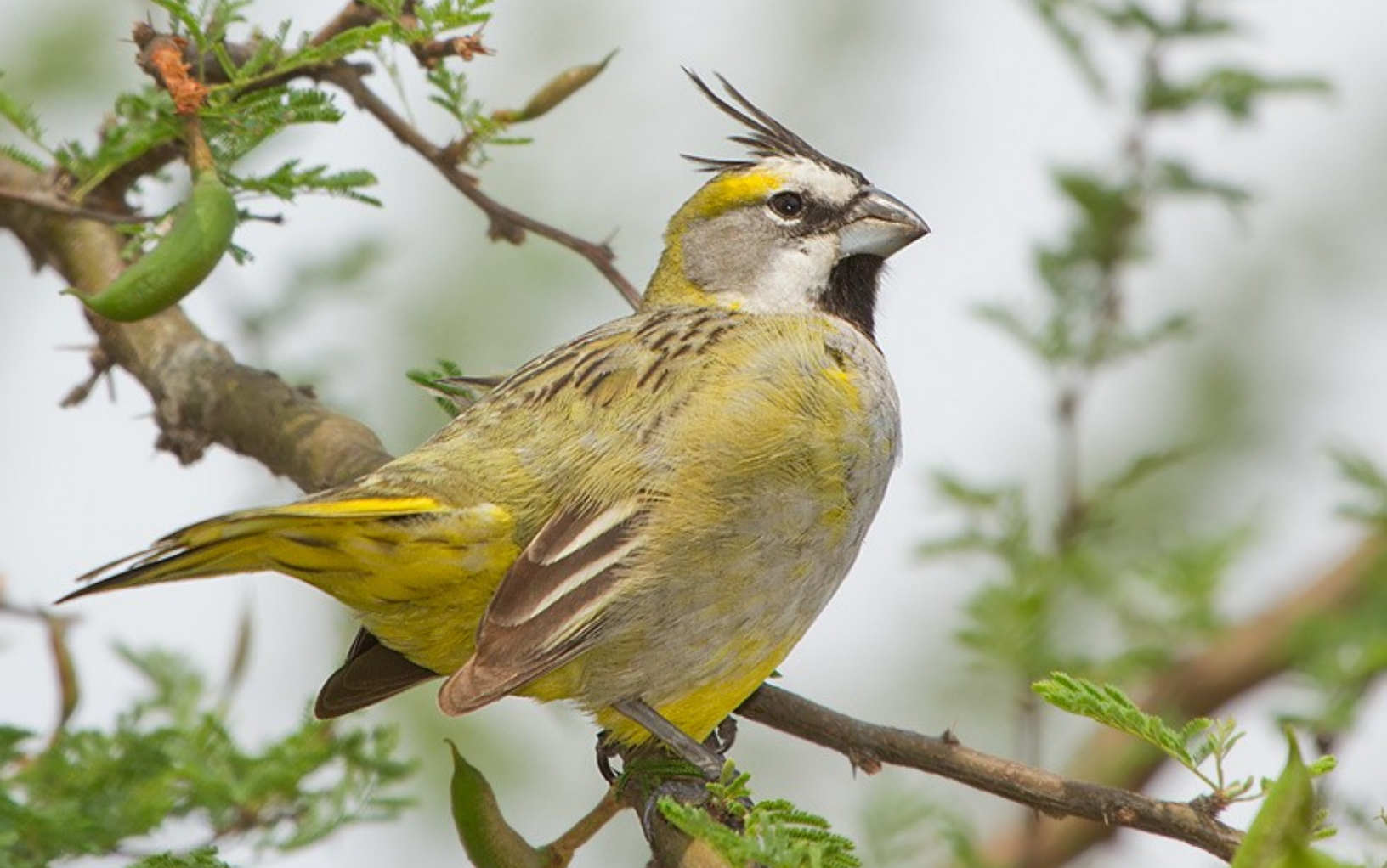
Yellow Cardinal (female)

Shearwater, Manx Shearwater, South American Tern and also marine mammals such as South American Fur Seal, Short-beak Common Dolphin, Dusky Dolphin and more. Closer to the shore we will also look for Chilean Flamingos, Royal Terns and Snowy-crowned Terns among others.