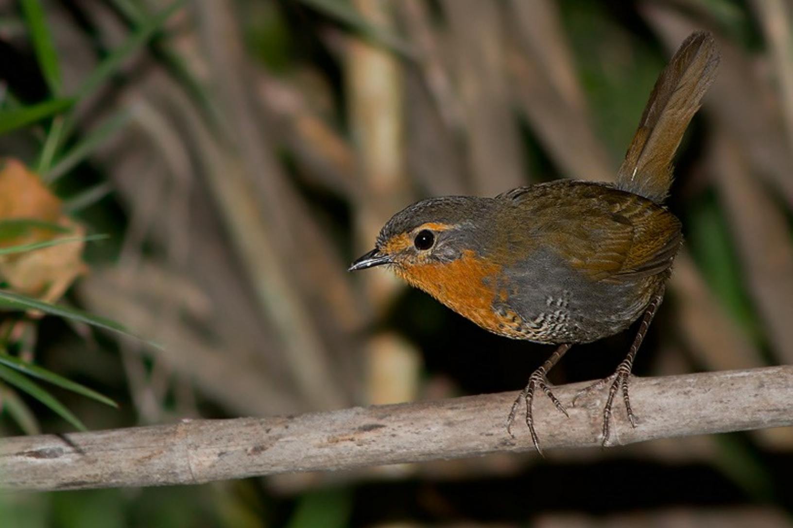
Chucaco Tapaculo

In the marshy areas we will start seeing locally very common Upland Goose , Ashy-headed Goose and Black-faced Ibis . After that we will drive to the town of San Martin de los Andes, where we will spend a couple of nights.