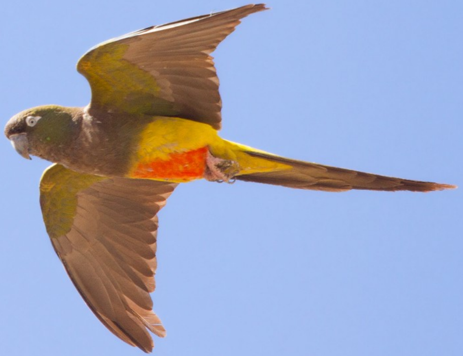
Burrowing Parakeet

After that we will go back from El Condor to Las Grutas partly through an alternative road which goes parallel to the San Matias gulf, where we will be trying to clear up the list before moving to General Roca, on a different part of Patagonia, after a pleasant night transfer from Las Grutas.