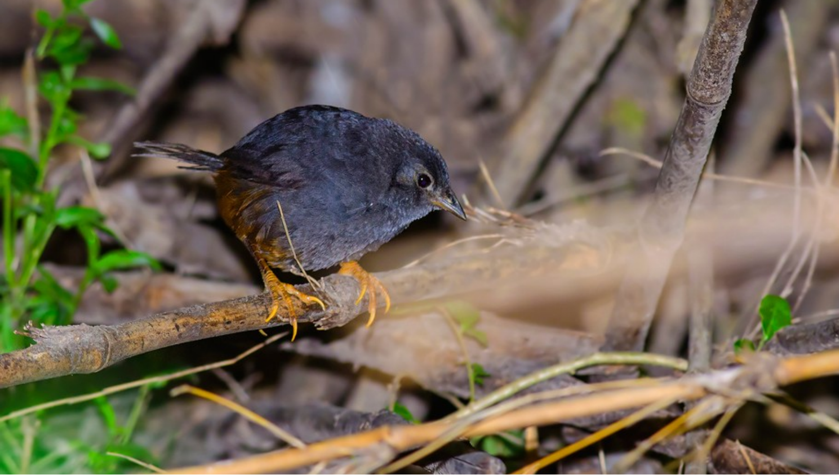
Ochre-flanked Tapaculo - © Andrés Terán

DAY 9: Arrival in General Roca and AM birding in Paso Cordoba and surroundings. PM transfer to Junin de los Andes with birding stops around Zapala. Night in Zapala.