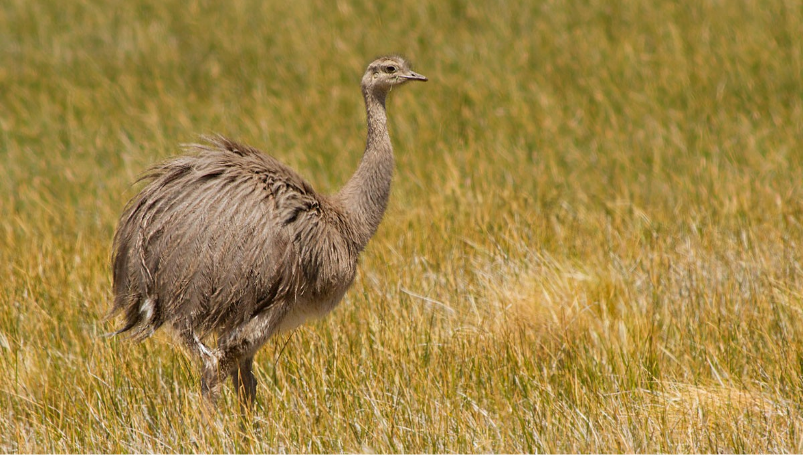
Lesser Rhea