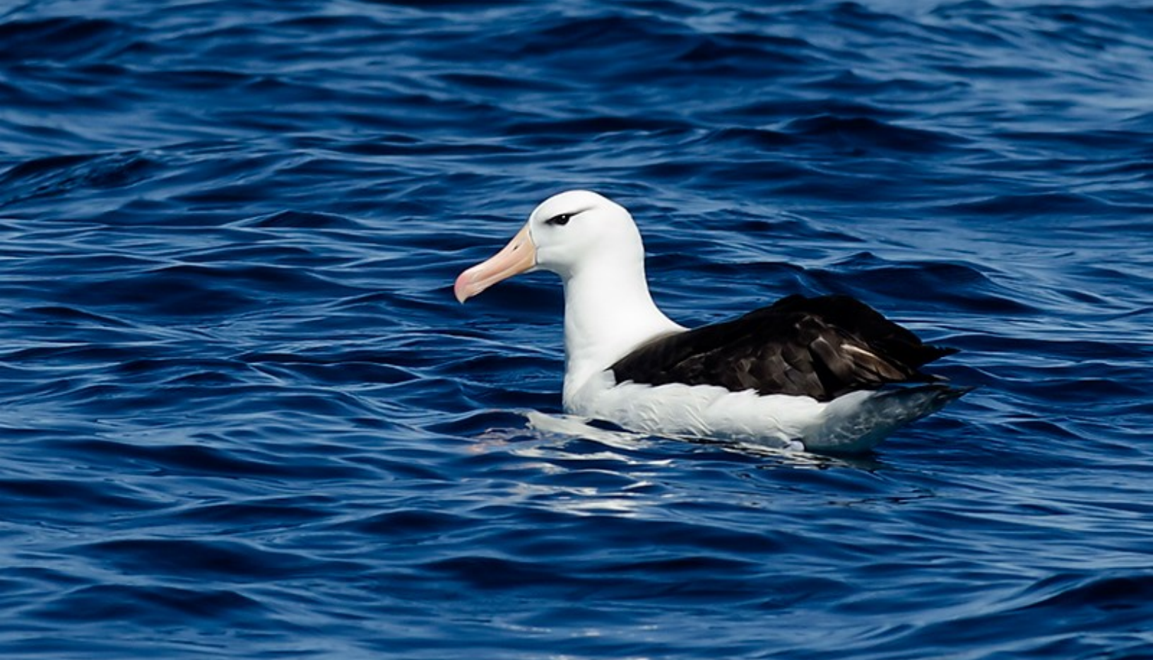
Black-browed Albatross