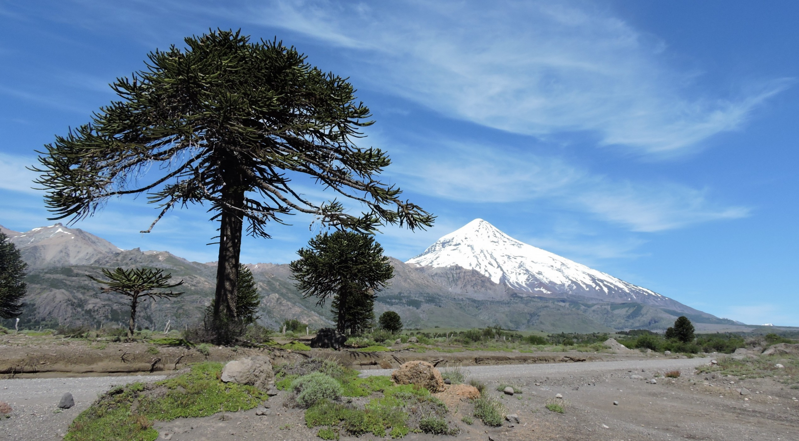
Lanin volcano and Araucaria trees in northwest Patagonia