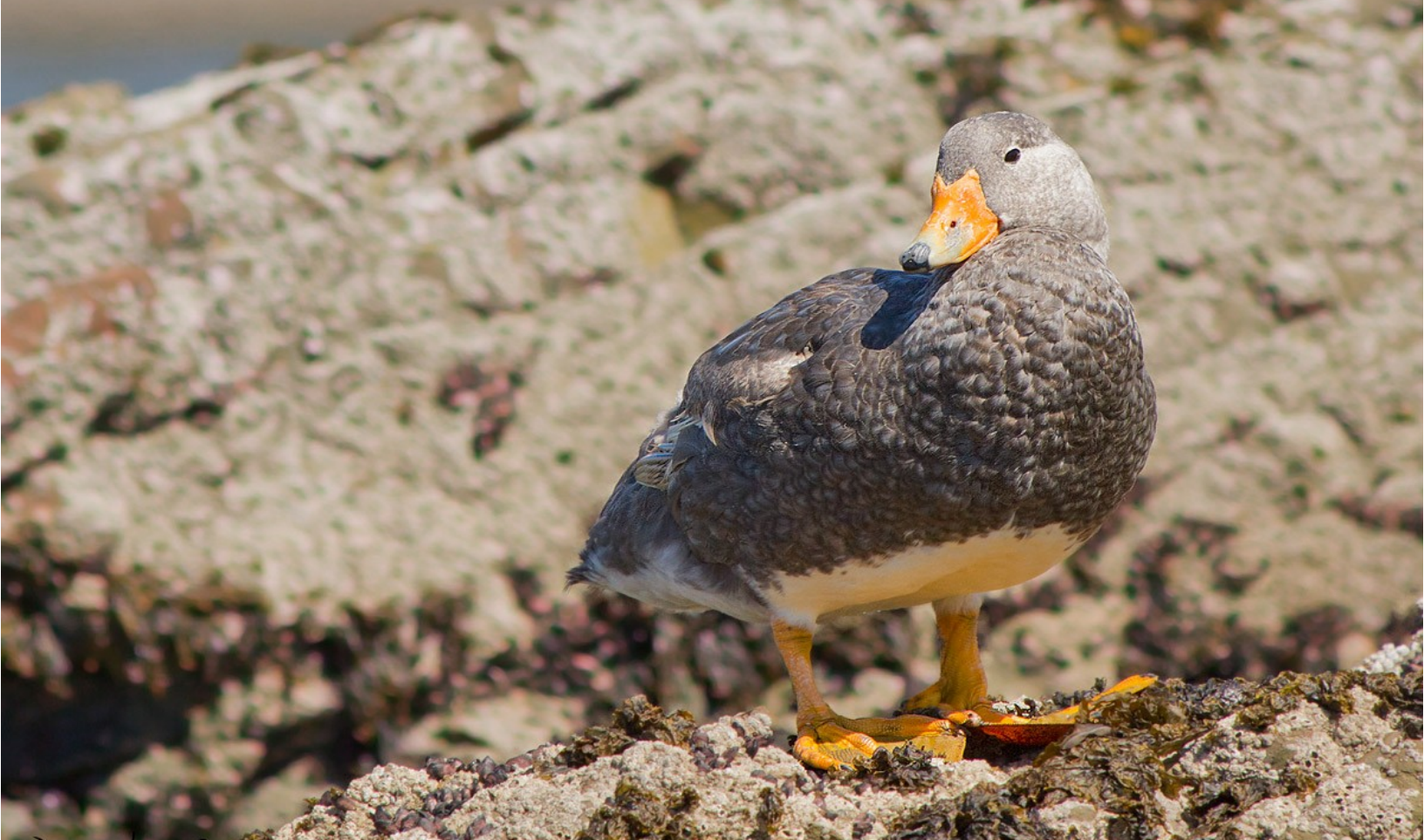
Flightless Steamer-Duck